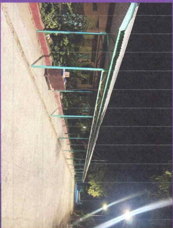
1.5m x 2.5m