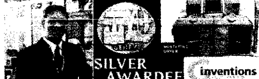
Dr. [Name] (left) receiving the Silver Award trophy from the Swiss Invention Society (SIS) for his invention of a new type of solar panel.

A 191 member of the Swiss Invention Society (SIS) awarded the Silver Award to a professor from the Mindanao State University (MSU) for his invention of a new type of solar panel. The professor, Dr. [Name], is a faculty member of the Department of Science and Technology (DOST) Office of Science Communication. He is also a member of the Philippine Science Teachers' Association (PSTA). The invention is a new type of solar panel that is made of a material that is more durable and efficient than traditional solar panels. It is also more affordable and easier to install. The professor's invention is a significant contribution to the field of renewable energy. It has the potential to revolutionize the way we generate electricity and reduce our dependence on fossil fuels.