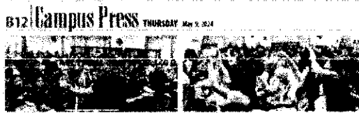
BUISU students and faculty members participate in the 2nd World Heritage Summit in Manila on May 21, 2024. The summit focused on the importance of heritage conservation and the role of education in promoting it.