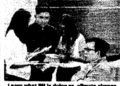
Learn what PH is doing vs. climate change

The first step is to take action. We feel it now. We see it now. We feel it now. We see it now. We feel it now. We see it now.